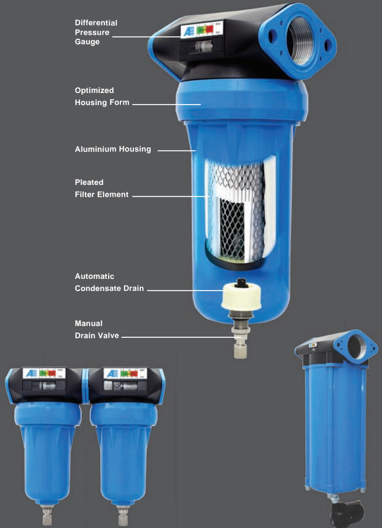
Manual Drain Valve